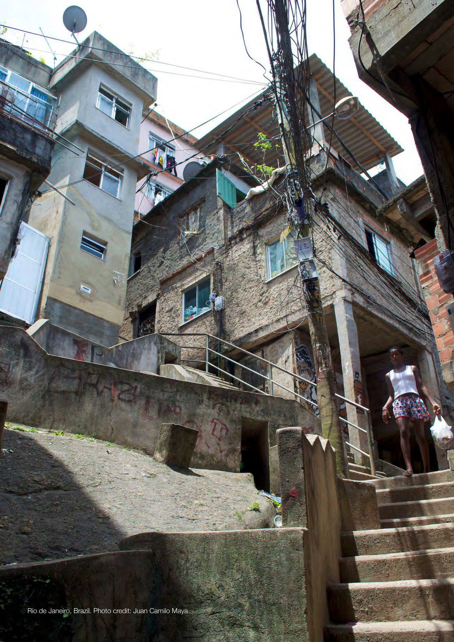
Rio de Janeiro, Brazil.