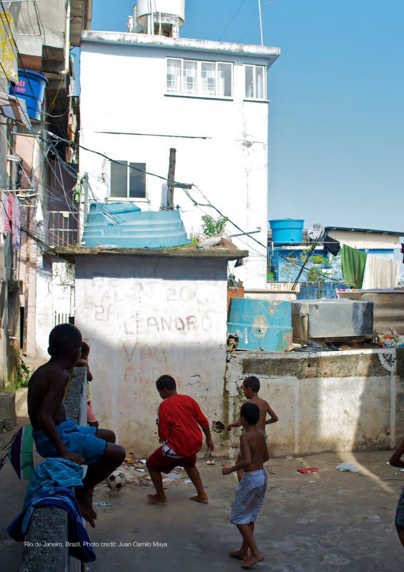
Rio de Janeiro, Brazil.