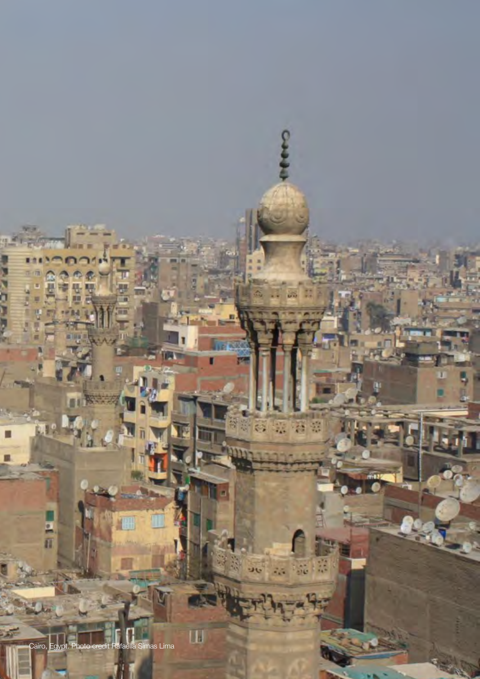
Cairo, Egypt.