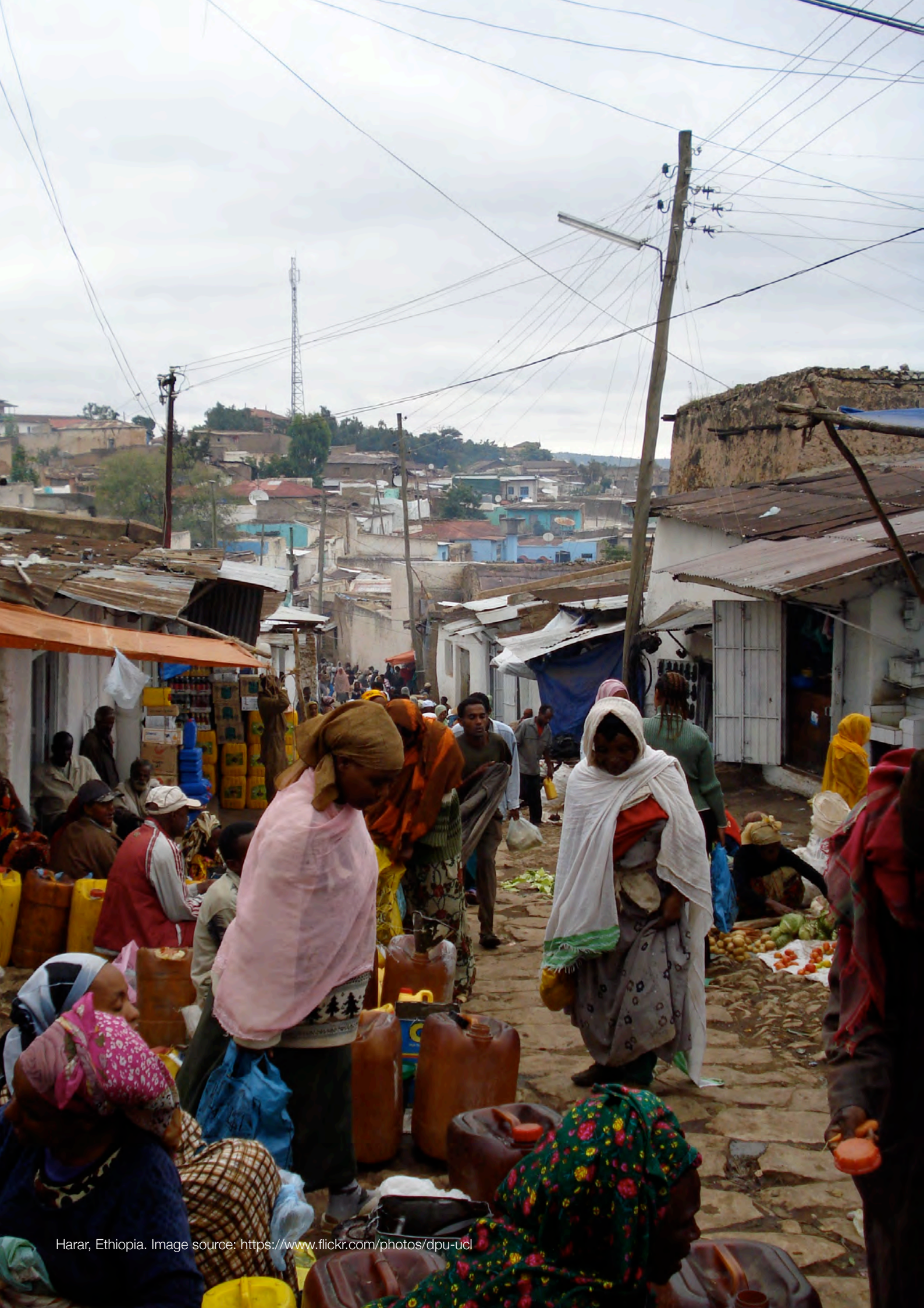
Harar, Ethiopia.